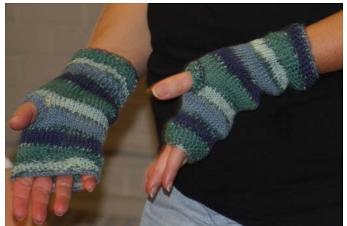
Knitter: Tammy Caltagirone