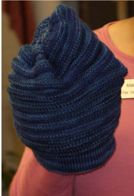
Pattern: Wurm Knitter: Marianne Moye