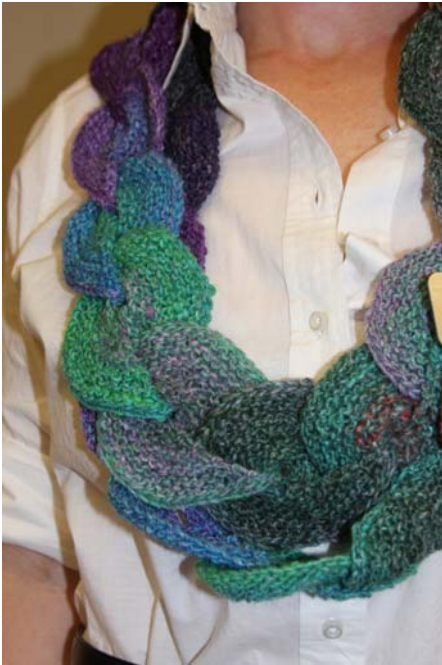
Pattern: Silk Garden Scarf / Necklace by Irina Poludneko Yarn: Noro Silk Garden Lite Knitter: Jennifer Duncan

Every guild meeting, we have Show and Tell as an opportunity for our members to display and discuss projects they have completed. Here is a selection of items featured at the October meeting. Information on the pieces is included if it was available. To see additional projects from this meeting, please visit the photo gallery at www.fvkg.com .